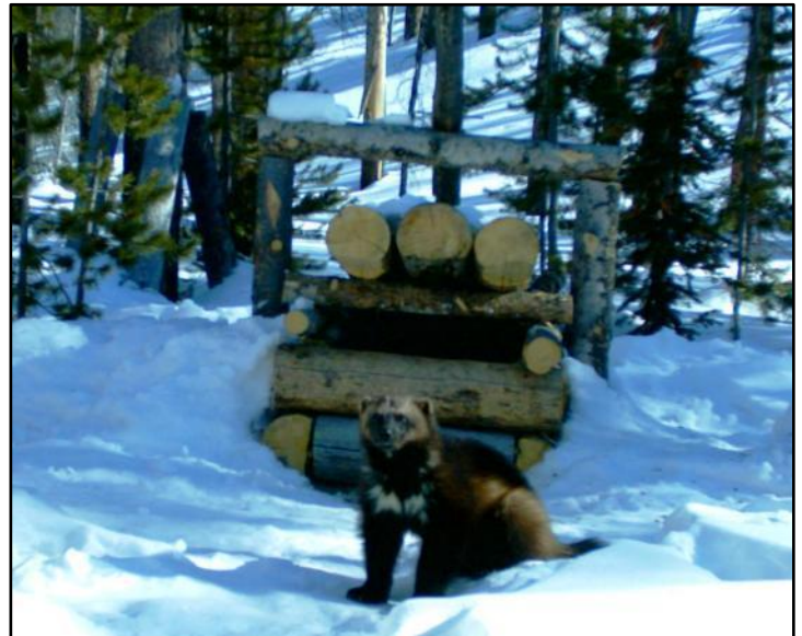
A wolverine at one of our 2011 pre-baited log-style traps on the Sawtooth National Forest. The lid is locked open, so he was free to come and go as he pleased last winter. He was certainly surprised this winter when the lid closed. He is now wearing a GPS collar for 3 months as one of our Stanley study area animals.

For the project to be able to understand the potential responses of wolverines to recreation, we need to look at a minimum of three landscapes with different and diverse recreation use patterns to monitor wolverines under a variety of conditions. Therefore, the work in our new study areas on the Sawtooth and Boise National Forests are as important as our initial work on the Payette National Forest has been.